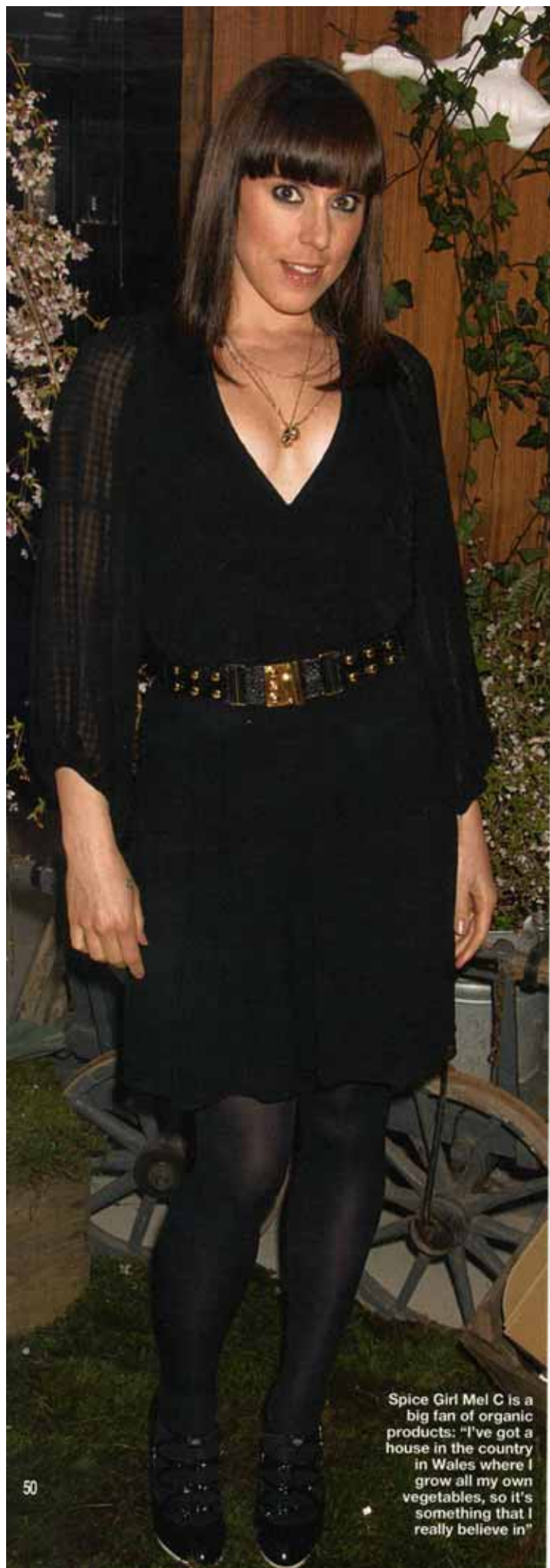
Spice Girl Mel C is a big fan of organic products: "I've got a house in the country in Wales where I grow all my own vegetables, so it's something that I really believe in"